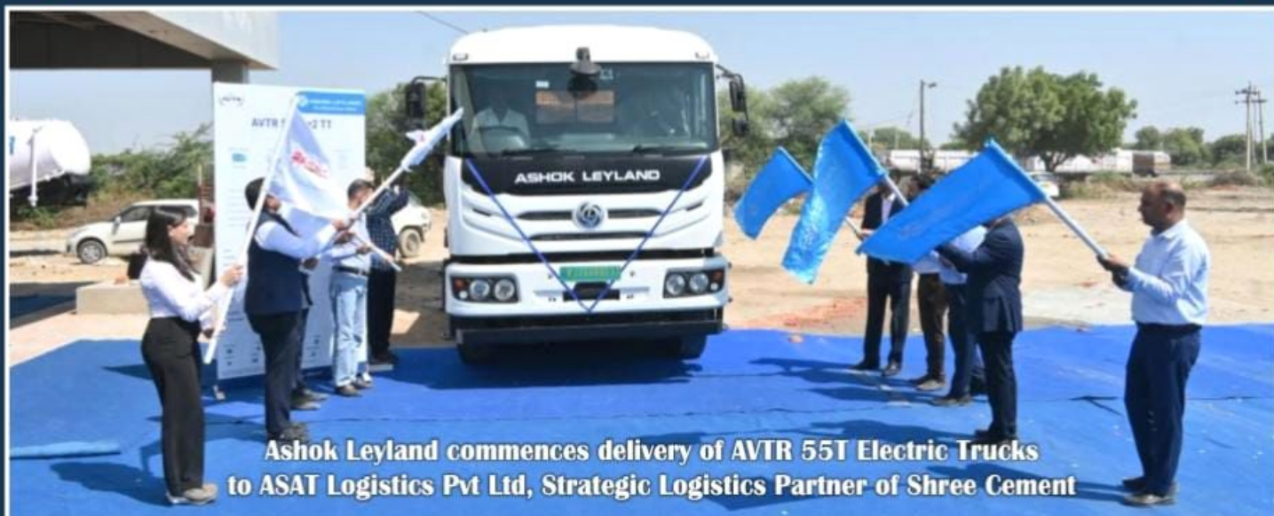
Ashok Leyland commences delivery of AVTR 55T Electric Trucks to ASAT Logistics Pvt Ltd, Strategic Logistics Partner of Shree Cement